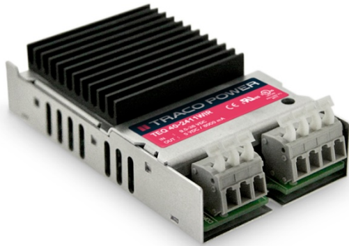
Fig. 3: 40 Watt DC/DC converter for the rail sector

On the part of the terminal device manufacturer, it is often expected that even non-CE-required power supply components are certified in accordance with EN 62368-1 to reduce the testing effort for EN 62368-1-compliant terminal devices.