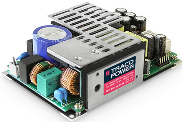
Fig. 2: 450 Watt power supply unit with CE certification for IT applications (EN 62368-1) and medical technology (EN 60601-1)

For power supplies not subject to the directive, no CE label may be issued. The limit below which power supplies are not subject to the low-voltage directive is defined at 50VAC or 74VDC. This indicates that AC/DC power supply units generally are subject to this directive and therefore must also have the EN 62368-1 certification as of 12/20/20 to continue to be legal for sale in Europe.