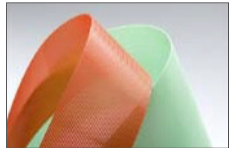
Temp-Flex FEP Commercial Flat-Ribbon Cable