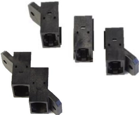
Angled Ear End Adapters