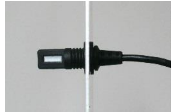
Through Hole Mount