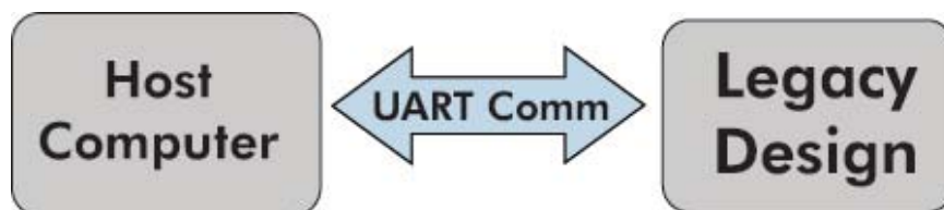
Figure 4. Legacy UART Design

Developers upgrading a legacy system with USB communications can choose any of the four options available for new designs, but they must select a USB solution that fits an existing application instead of designing an application to fit a USB solution. In this case, developers need to consider the current means of communication, the required USB data throughput and the available PCB space for additional components. Legacy designs have an established means of communicating with host systems. The addition of a fixed-function USB communication bridge is only an option if the interface used to communicate with a host is available in a bridge device. In most applications, this will be the UART interface. For these applications, a USB-to-UART communication bridge chip can be added to a design. Figures 4 and 5 show how the addition of a bridge device fits into a legacy design.