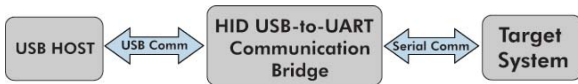
Figure 2. HID USB-to-UART Device

The HID device class is gaining acceptance as a general connection option for embedded systems because of its flexibility, overall throughput and lack of driver installation. Because the HID class is natively supported by most operating systems, driver development is not required, and end-users can plug in a device right out of the box and begin using it. There is no need for driver installation by the end-user. In the previous USB-to-UART VCP example, the bridge device can be replaced with an HID USB-to-UART device, as shown in Figure 2.