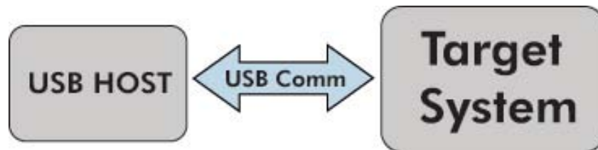
Figure 3. USB Host System Configuration

In addition to increased development time, developers should also consider the required throughput. The throughput limit of an HID class device is 64 kilobytes per second, or 512 kilobits per second. The throughput limit of a non-HID class device is 12 Megabits per second, or 12,000 kilobits per second. The non-HID class device can achieve much higher throughput than the HID device but also requires the development of a custom driver and installation of a driver by the end-user. This will add to the application's overall development time. Driver development and installation can be avoided by using an HID-configured USB MCU but only if the throughput of HID is sufficient for the application.