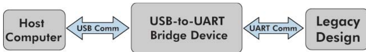
Figure 5. Legacy Design USB-to-UART Upgrade

From a hardware perspective, the existing PCB needs a redesign to allow the USB device and USB connector to fit on the existing board. From a software perspective, the manufacturer of the USB-to-UART device often provides a VCP driver to the developer; therefore, no driver development is required. In this example, the throughput limit of the bridge device is the baud rate of the UART interface. As long as the bridge device supports the application's required baud rate, throughput should not be an issue. The device still appears as a COM port to the USB host, which allows legacy host applications to function correctly without modification. The main difference between the legacy design and the upgraded design is the provision of an interface to the host through USB and the need for driver installation by the end-user.