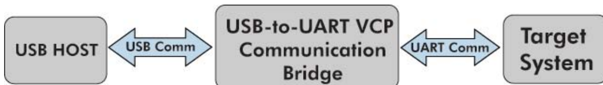
Figure 1. USB-to-UART VCP Bridge

Fixed-function USB communication bridges provide the easiest solution for adding USB communications to a new design but offer the least flexibility. They are available as HID or non-HID fixed-function USB communication bridges, such as the USB-to-UART virtual COM port (VCP) bridges. When using these communication bridges, USB expertise is not necessary because USB firmware and driver development are not required. For non-HID class devices, manufacturers provide the necessary drivers for supported operating systems. In addition, manufacturers often provide dynamic-link libraries (DLLs), which aid in the development of USB host applications. The lack of USB firmware, DLL and driver development reduces the application's time to market. With this approach, the USB interface is not directly connected to the target system. Instead, another bridge device interface, such as UART, serial peripheral interface (SPI), or inter-integrated circuit (I 2 C), directly connects to the target application. In the following system, a USB-to-UART VCP bridge communicates with a target system through the UART interface.