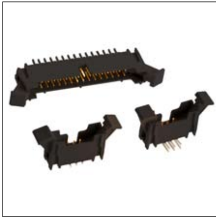
3M™ Latch/Eject Header, 2 mm

***RoHS Compliant 2005/95/EC" means that the product or part ("Product") does not contain any of the substances in excess of the maximum concentration values in EU Directive 2002/95/EC, as amended by Commission Decision 2005/618/EC, unless the substance is in an application that is exempt under EU RoHS. This information represents 3M's knowledge and belief, which may be based in whole or in part on information provided by third party suppliers to 3M.