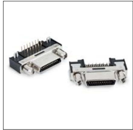
3M™ Shrunk Delta Ribbon (SDR) Connector