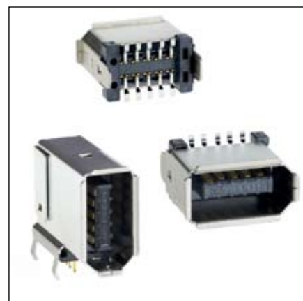
3M™ Shielded Compact Ribbon (SCR) Boardmount Connectors