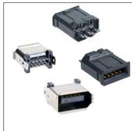
3M™ Shielded Compact Ribbon (SCR) Wiremount Connectors