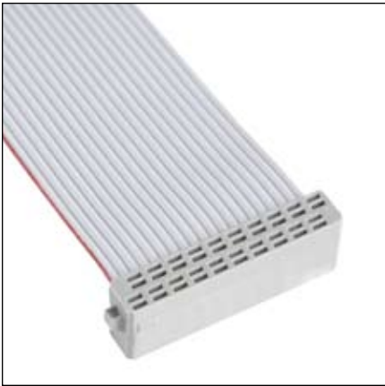
3M™ Molded-On Cable Assembly, 2 mm