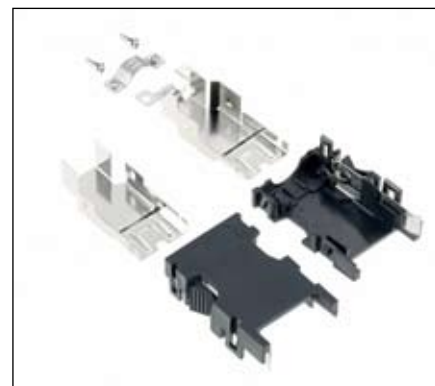
3M™ Shielded Compact Ribbon (SCR) Shell Kits