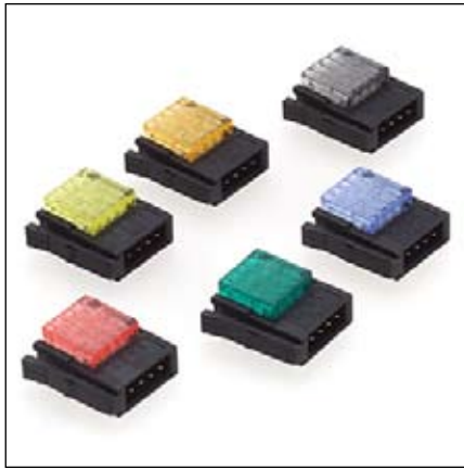
3M™ Wiremount Connector, Mini-Clamp Plug