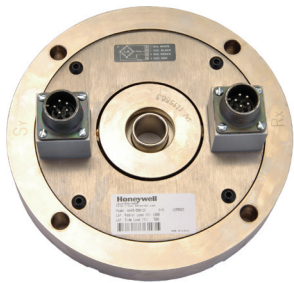
Model 6443 Series load cell

Uniformity testing machines measure both the Radial Force Variation (RFV) and the Lateral Force Variation (LFV). RFV indicates the change in force when the tire rotates under varying load conditions, and LFV represents the steering effort pull in either the left or right direction. Based on these two measures, the machines then ascertain where final grinding or cutting can optimize the tire before a final grade is applied on the finished tire. Without a uniform, properly balanced tire/wheel, a vehicle would rattle and shake. Tire uniformity testing machines are extremely important since they help provide a smooth ride. And for tire manufacturers, producing the most uniform tire allows for a higher grade of tire to be sold.