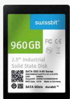
NAND FLASH PRODUCTS

More than 5000 customers around the world including Fortune 500 companies and the world's leading OEM's already rely on Swissbit for their safety-critical data-storage requirements.