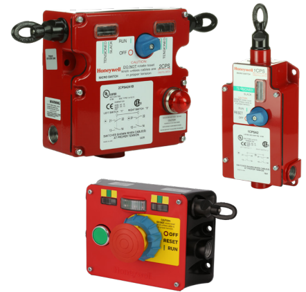
Figure 1. Honeywell MICRO SWITCH Cable-Pull Switches

The snap-action operation causes the switch contacts to change state and mechanically latch almost simultaneously when the cable is pulled, slackened or broken. The NC switch contacts remain open until the cable-pull switch is reset by properly tensioning the cable and manually rotating the reset knob. When the positive-opening switch contacts open, the optional auxiliary contacts also actuate (i.e. NO contacts close). The auxiliary contacts are electrically isolated from the direct-opening, normally closed switch contacts. These NO (Normally Open) contacts may be used for monitoring or signaling.