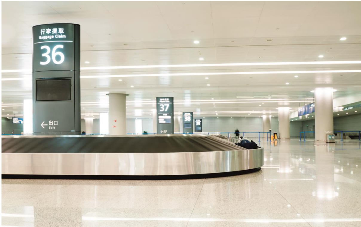
Figure 1 (Lead Image) - Electrical drive technology plays a role in many areas of everyday life – and energy efficiency is one of its key requirements.

Power electronics – as used in drive technology or photovoltaics – plays a role in many areas of our everyday life. Currently, it is also gaining in importance thanks to the growing demand for energy efficiency. For instance, 40 percent of today's global electrical power consumption goes into electrical drives. Complex power electronics ensures optimal use of electrical power behind the scenes (Figure 1, lead figure).