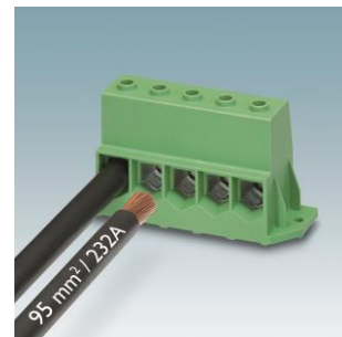
Figure 2 - With a current-carrying capacity of up to 232 A, the newly developed MKDSP 95 PCB terminal block is the most powerful wave-solderable PCB terminal block on the market.

The MKDSP 95 PCB terminal block – today's most powerful wave solderable PCB terminal block on the global market – represents a viable solution (Figure 2). The rated current is 232 A according to IEC and 200 A according to UL. Where an expensive copper busbar installation was previously needed, the device manufacturer can now use a simple solderable solution, which no longer requires separate operations during production. A standard PCB with multilayer technology carries the high current. Bolts, nuts, and special busbars are no longer needed.