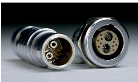
Fig 3. ODU MINI-SNAP® hybrid connector & receptacle

ODU is a manufacturer that serves both the military and commercial markets. The company has addressed the need for hybrid connectors in several of its products through most of its product families, each with their own advantages. In the simplest form, ODU AMC®, ODU AMC® High-Density, ODU MEDI-SNAP® and ODU MINI-SNAP® product lines can support multiple contact sizes within the same connector, thus allowing those connectors to carry both signals and power for USB® and other high speed interfaces. There are also versions of ODU MEDI-SNAP® and ODU MINI-SNAP® products that support fluid interfaces in conjunction with traditional electrical signals (Figure 3).