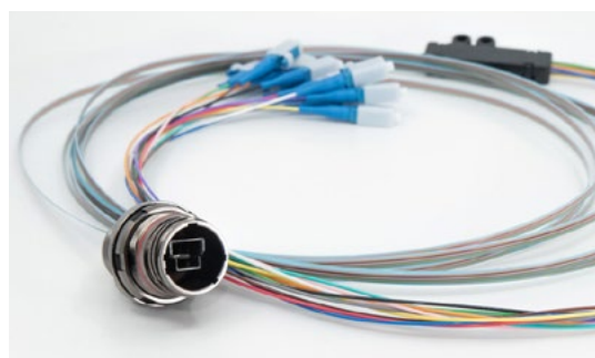
Fig 4. Electrical and fiber optic hybrid cable

The following examples are actual customer applications, for which ODU developed unique hybrid custom connectors and cables: