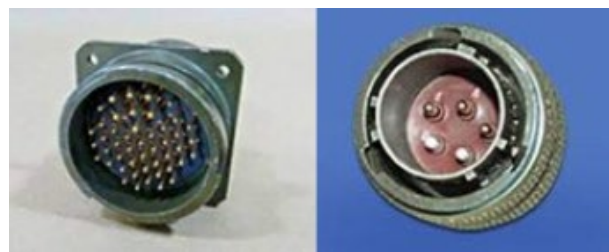
Fig 2. MIL-Spec connectors

combined in these connectors. Such hybrid solutions are exemplified in Figure 2 – on the left, power and signals are combined; and on the right, coax and signals.