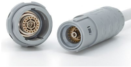
Fig 5. ODU MEDI-SNAP® size 3.5

The third application example was for an interface capable of carrying control signals, power and air-supply to a professional dental cleaning device. The primary challenge in this case was the high-power requirement – 8.5 kW at 1.25 kV AC. ODU engineers developed a hybrid solution based on the ODU MEDI-SNAP® Size 3.5 (Figure 5), which not only met the requirements, but was also low weight thanks to the connector's plastic housing.