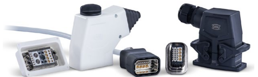
Fig 7. ODU-MAC® assemblies for manual mating

The user can define their needs as a list of required modules, and the connector can be built to meet those requirements. Module options include, but are not limited to signals, high current, high voltage, high-speed standards (e.g., USB® 3.2, HDMI® and Ethernet), RF coax, fiber optics and fluids. Custom contacts have also been developed for many applications. Furthermore, there are options for automatic and manual docking.