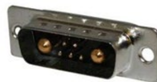
Fig 1. D-subminiature connector

lines of the relevant power supply. Over time, signal lines were added and numerous connector package designs evolved. Connectors designed for one function were adapted to support both power and low-level signals. D-Subminiature connectors are a good example of this and are among the earliest standardized hybrid connectors supporting high power plus signal lines (Figure 1).