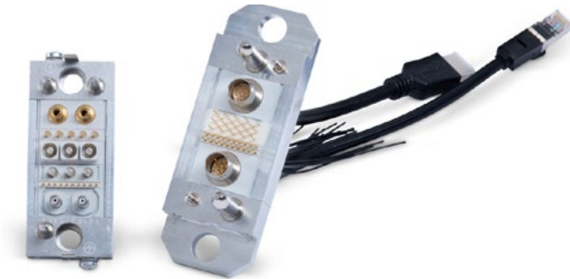
Fig 6. ODU-MAC® assemblies for automatic mating

These ODU-MAC® hybrid interfaces, along with the availability of non-magnetic ODU contacts, have led ODU to be the leader in MRI plug in applications. The ability to combine many interfaces into a unitized and hybridized block simplifies the connecting process, guarding against mistakes, and solving wire management issues.