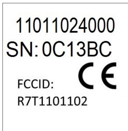
Figure 3: (Example) Proteus-III label containing the CE logo and the FCC ID R7T1101102

Please refer to the user manual of the standard radio module, chapter "General labelling information", to check which information can be placed on the module label.