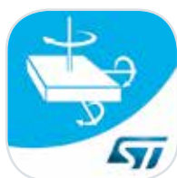
ST Sensors Finder