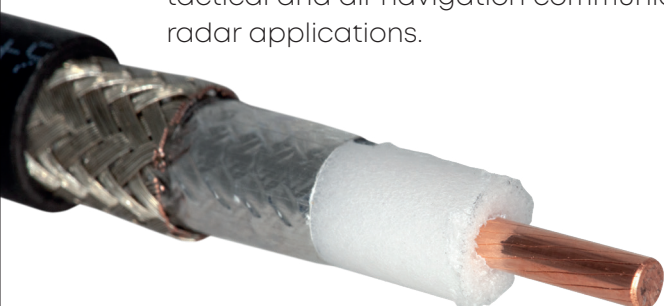
Spuma 400 RS-FR

In addition, the HUBER+SUHNER Spuma RS FR has a low loss inner conductor. This product is the most flexible cable in the Spuma family and features a new TPU jacket material which provides flame retardancy without compromising on flexibility. Spuma RS FR is used in radio, tactical and air navigation communication systems as well as in vehicles, marine, airfield and radar applications.