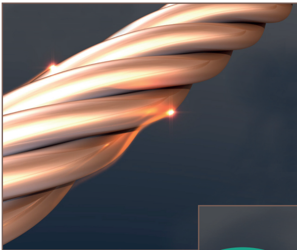
Cable with standard true concentric strand

Rotary swaging is a process of mechanical deformation and is achieved by generating repeated blows to a conventional strand. Using hammers, the surface of the stranded wire is smoothened. A nearly perfect round and smooth surface is guaranteed.