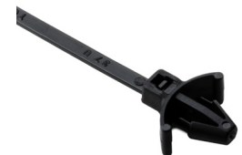
One-piece with wings