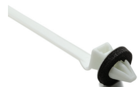
One-piece with foam or TPE seal