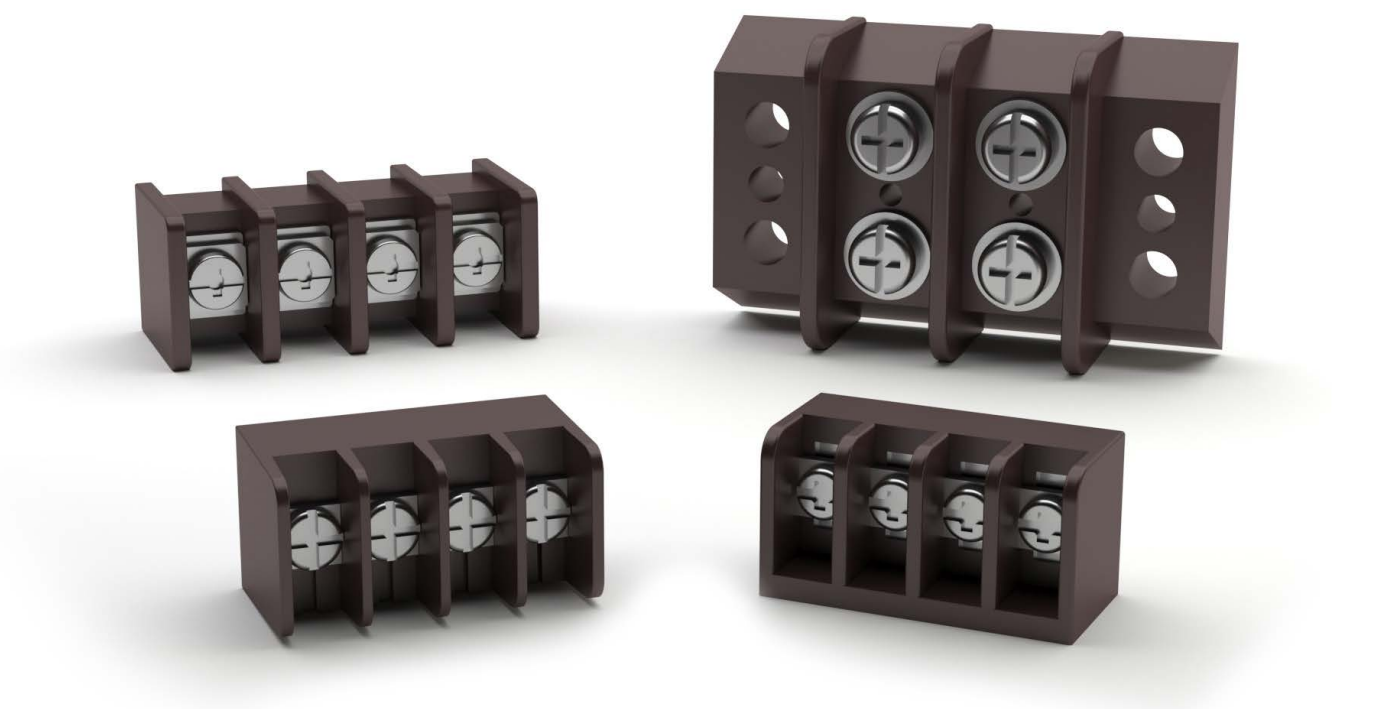
TB SERIES PART NUMBER CONFIGURATION