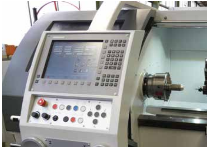
PROFIBUS is popular in manufacturing, process automation, and building automation.

“The difference between Ethernet and bus protocols of any kind, is Ethernet’s use of the TCP/IP protocol.”