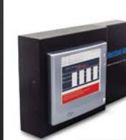
FirstLine BMS Battery Management System