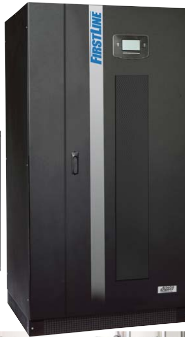
FirstLine P Three Phase UPS