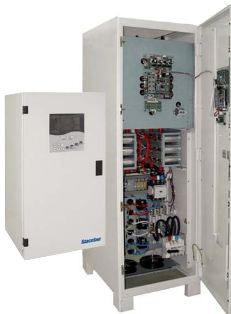
StacoSINE Active harmonic Filter Products