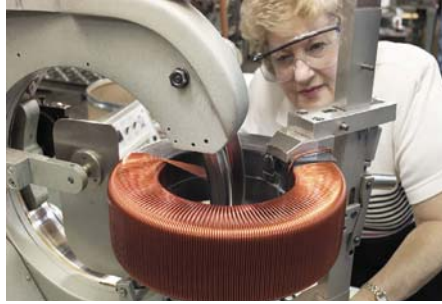
Coil Winding for VT, Test Set, and Voltage Regulator Applications

The Staco Energy Products Company line of variable transformers is the most extensive available, containing over 1,400 part numbers. From simple plug and cord models for bench testing, to complex ganged units, we can provide it.