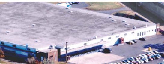
Staco Energy Products Company Headquarters, Dayton, Ohio