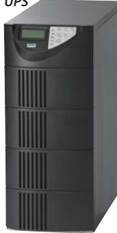
UniStar P Single Phase UPS

The StacoSine® Active Harmonic Filter detects and corrects all harmonic orders between the 3 rd and the 51 st , automatically. In sizes from 25 to 200 amps, the StacoSine® can address any harmonic situation you may encounter.