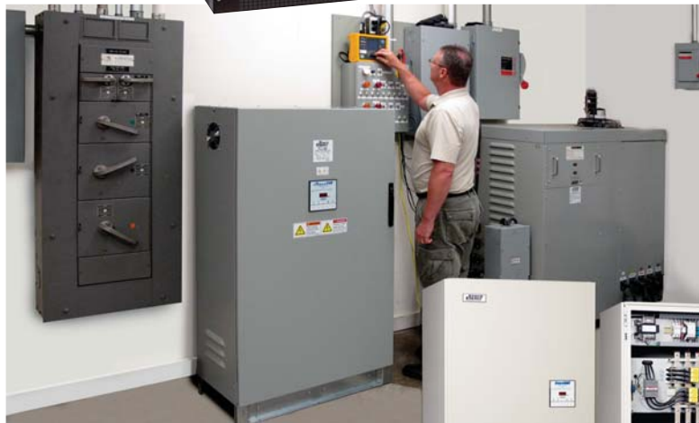
StacoVAR Power Factor Correction Products