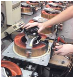
100% of our product is tested before it ships.