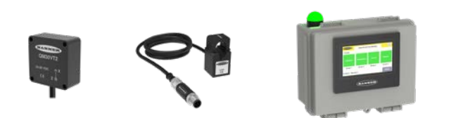
Vibration and Temp Sensor