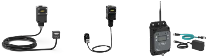
Vibration and Temp Sensor