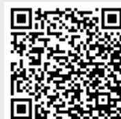
Access the Digital Version

Visit www.bannerengineering.com/monitoringsolutions to build your next monitoring system, find an authorized distributor, or chat with a technical expert.