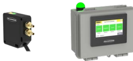
Differential Pressure Sensor