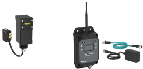
Differential Pressure Sensor