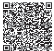
Scan to View Products