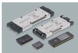
BCM bus converter modules