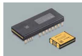
NBM fixed ratio DC-DC converter