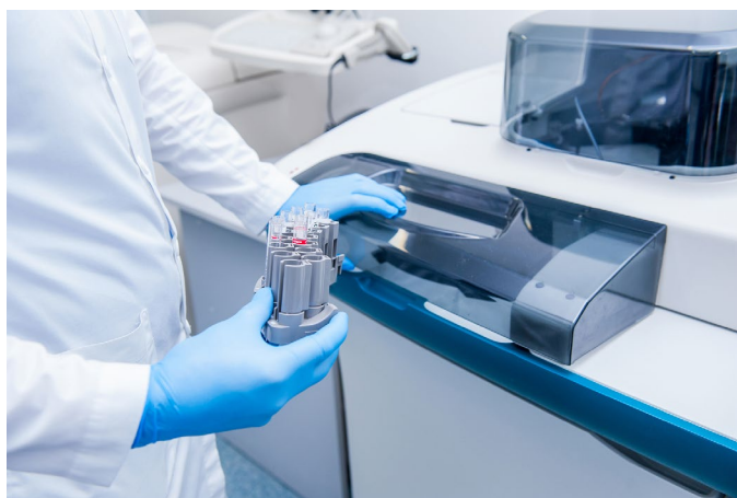
Medical Regents used in laboratory testing require proper refrigeration.

Government bans of many refrigerants essential to other thermal technologies also affect reagent storage equipment designs. Refrigerant-free thermoelectric coolers deliver a more environmental friendly solution for temperature control of reagents.