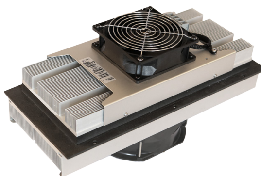
Outdoor Cooler AAX-260

In addition to the traditional vertical mounting, horizontal mounting is now possible, providing the ability for compartment cooling. The compact design and optional mounting features allow the thermoelectric cooler assembly to be installed in a specific section of the kiosk to cool vital components or batteries in that compartment. This compartment will need to be thermally insulated to protect against outside temperatures. Keeping the electronics and thermoelectric cooler assembly separated from the rest of the enclosure can reduce the cooling capacity requirements due to lower heat load removal.