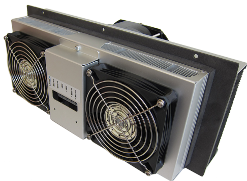
Outdoor Cooler AA-230

Tark Thermal Solutions offers the Outdoor Cooler Series, which is a rugged, compact air-to-air thermoelectric cooler assembly product family designed for cooling and heating critical electronics in outdoor kiosks. They run on an open loop at nominal voltages of either 24 or 48 VDC, within a wide operating temperature range from -40°C to +55°C. Cooling capacities range from 100 to 480 Watts and are mountable with appropriately sized hardware. The optional bi-directional controller, SR-54 which cool and heat to specific set point temperatures is sold separately. The fans can be controlled once steady-state is reached to reduce noise. stabilization from room temperature down to 180 Kelvin with no outgassing.