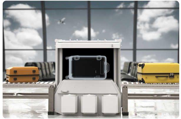
In luggage scanning equipment, bags are placed on a conveyor and pushed into the X-ray set-up.

Several companies manufacture industrial X-ray scanning equipment, and typically out-source their liquid cooling system needs. They require liquid cooling systems that are reliable and cost-effective. They must offer high performance while being easy to service, minimizing system maintenance and down time for repairs. Although X-ray tubes have a limited life, users expect a liquid cooling system lifespan that equals that of the complete scanner.