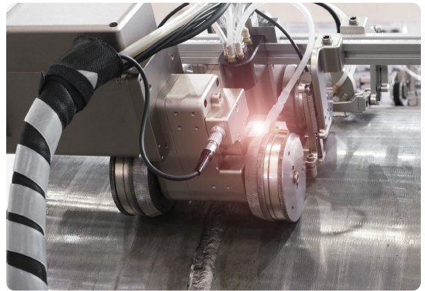
Pipeline inspection stations require a robust liquid cooling system to ensure reliable operation.