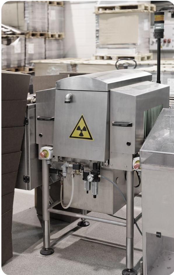
X-ray scanning equipment is often used for quality control in food processing plants.

Industrial scanning equipment like X-ray machines are used in a wide variety of applications, ranging from non-destructive evaluation looking for manufacturing defects and contaminants to scanning trucks or baggage to ensure safety and security. X-ray inspection can be used for both process and quality control in automated assembly lines. Only a small portion of the energy generated by these systems is emitted as X-rays; the balance is released as heat. Industrial X-ray systems, which can generate several kilowatts of heat during operation, require cooling of the anode to dissipate this heat for optimized performance and a longer operation life. Liquid cooling systems provide an excellent cooling mechanism to transfer the heat from the system to the ambient environment. Thermal management systems that feature liquid cooling offer higher efficiencies than air-based heat transfer mechanisms, which translates into higher reliability, reduced field maintenance, greater system uptime and lower total cost of ownership.