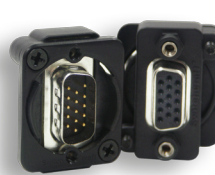
EHHD15MFB (black)* EHHD15MF (nickel)*