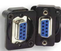
EHHD9FFB (black)* EHHD9FF (nickel)*