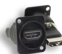
EHHDMI2B (black) EHHDMI2 (nickel)

*replace M or F in part number for male or female contacts, respectively. All combinations available.