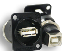
EHUSBABB (black) EHUSBAB (nickel)