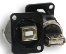
EHUSBBAB (black) EHUSBBA (nickel)