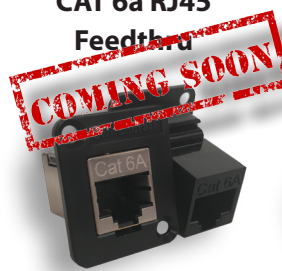
EHRJ45P6AS (shielded) EHRJ45P6A (unshielded)