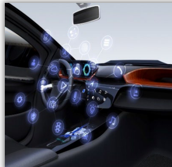
Telematics unit in automotive