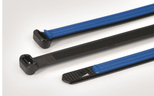
Soft Grip Ties (SGT)