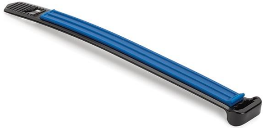
Soft Grip Ties (SGT)