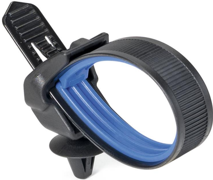
Arrowhead mount for hole mounting

Reduces the number of steps for fastening