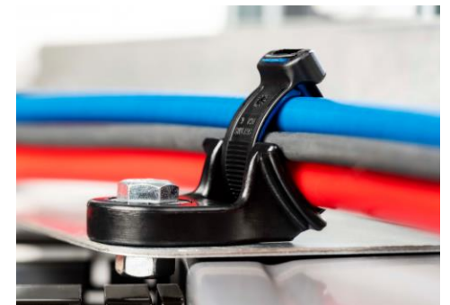
Unassembled set HDM320