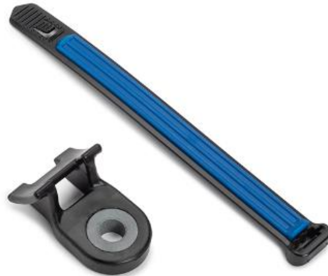
Screw mount with rivet for bolts, studs or screws