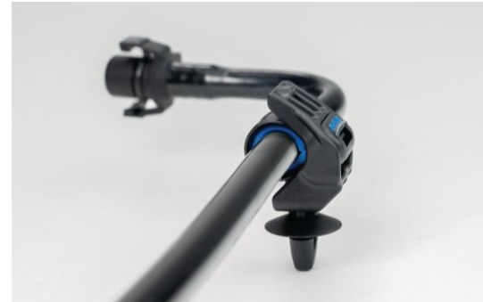
Soft Grip Tie (SGT) assembled with Soft Grip Mount (SGM) for holes