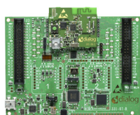
DA14695 Development Kit-Pro