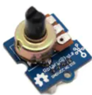
1X Grove Rotary Angle Sensor