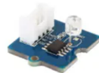
1x Grove Light Sensor v1.2