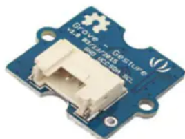
1X Grove Gesture Sensor