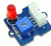
1X Grove RED LED