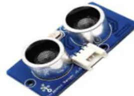
1x Grove Ultrasonic Ranger