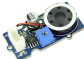
1x Grove Speaker