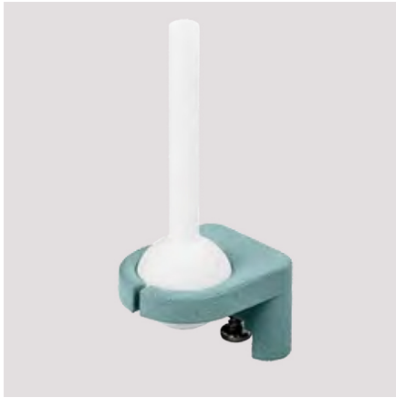
JOYSTICK FOR 3D 2 GO KIT