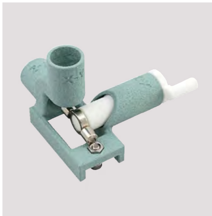
OUT OF SHAFT FOR 3D2GO