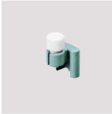
ROTATE KNOB 3D 2 GO KIT