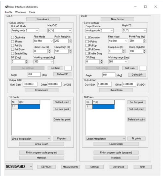
UI tool for development