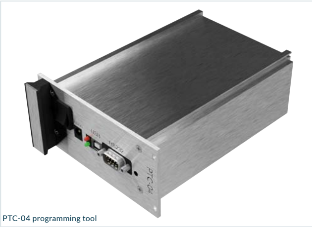
PTC-04 programming tool

Communication is done through a standard RS-232 null modem cable to a COM port of the PC or via USB. The PC requires no custom configuration, allowing the programmer to be used with any PC with a COM port speed of 115.2kbs or a standard USB 1.1 or USB 2.0 (Type A) interface.