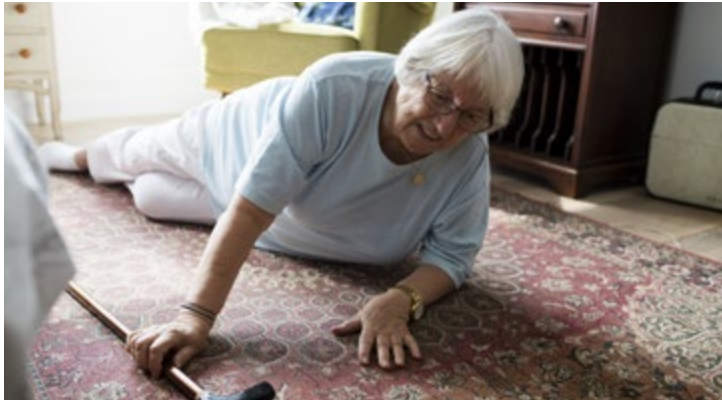
Figure 1: TI mmWave sensors can be used for stance detection in elderly, disabled and emergency monitoring systems.

According to Forbes , by 2050, the global population of people over the age of 60 is expected to hit 2 billion. To put this into perspective, this will represent over a fifth of the world's population. With a growing elderly population comes the need for more advanced in-home monitoring, while still allowing people to maintain personal autonomy. According to the U.S. Centers for Disease Control and Prevention, nearly one-fourth of seniors fall every year and falls are the leading cause of trauma-related hospital admissions among older adults, as shown in Figure 1 . Fall detection systems can use sensor-driven solutions to provide non-contact, non-privacy invasive sensing through accurate point-cloud data.