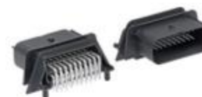
Headers R/A headers and unshrouded headers available