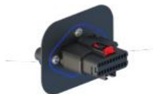
Panel Mounts 2x3, 2x6 and 2x10 circuit sizes available.

Offers a compact connector and helps eliminate cost assembly