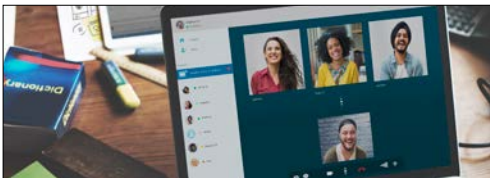
5G Networking/Telecommunications Communication Modules (WiFi Routers and Mesh Devices)