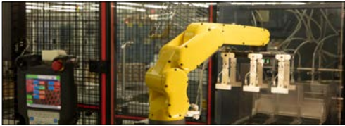
Industrial IoT / Robotics & Factory Automation