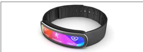
Wearables (Smart Watches, Health Monitors, AR & VR)