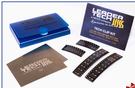
Kit Tech Clip