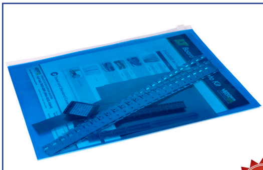
Kit Proto Shields