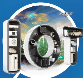
IoT and LED Power Supply