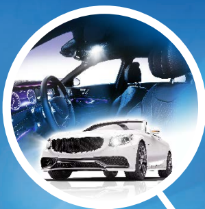
Automotive- Compliant LED Lighting