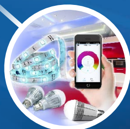
Industrial LED Lighting