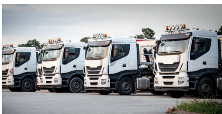
TRUCK AND BUS