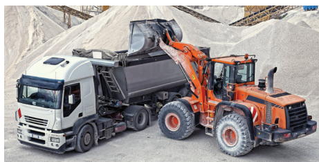
HEAVY AND OFF-ROAD VEHICLES