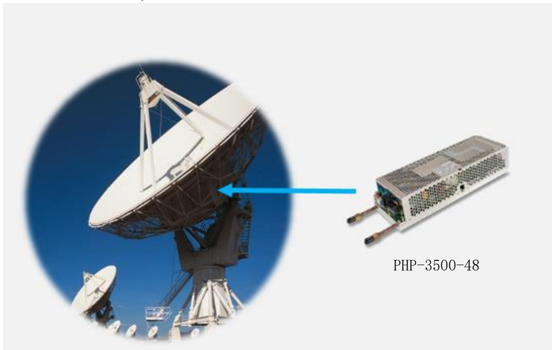
Fig.2 Radio Frequency Transmission Application