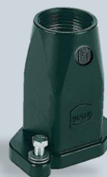
HPR IP68/69k For the most rugged environments