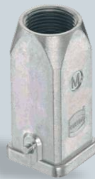
EMC For higher EMC requirements