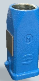
Class 1 Division 2