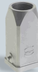
INOX Stainless Steel