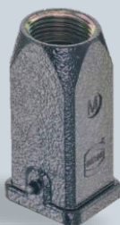
Marine For outdoor use