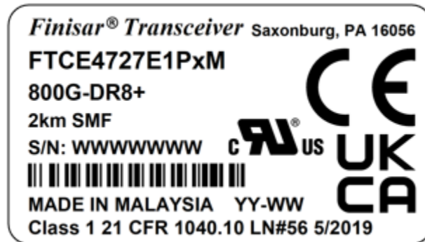
Figure 3. Product Label