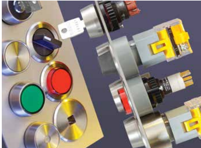
How contacts make or break can minimize arcing, welding, and bounce.

“Electronic switches are rated for current, voltage, voltage type (AC, DC), and load type (inductive, resistive).”