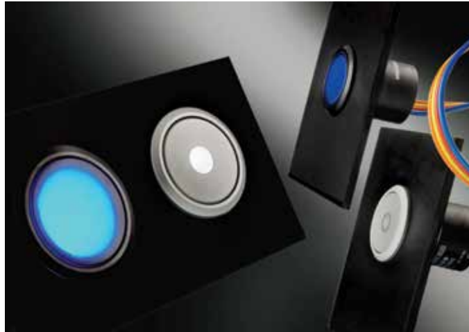
Component ergonomic considerations such as configuration, size, illumination, and tactile feel enhance advanced HMI systems.

“Arcing is also more severe when handling high inrush currents, i.e. inductive and capacitive loads that require high initial current.”