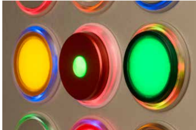
Switches with multiple lenses or RGB LEDs can provide more information.

“Modular switch designs offer greater flexibility.”