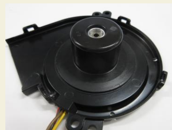
Epoxy resin coating of motor (IP68)