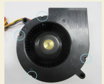
Outlet Drain Holes