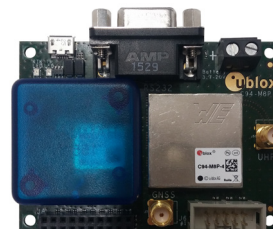
C94-M8P application board