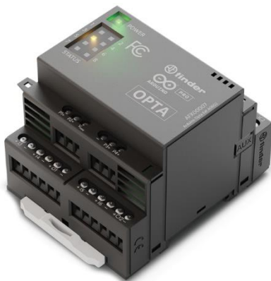
Figure 1. An OPTA module.

Arduino designs, manufactures, and supports electronic devices and software, providing people globally with access to advanced technologies that interact with the physical world. Their products are straightforward, simple, and powerful, fulfilling the needs of users with ease. The PLC IO expansion exemplifies this, offering an easily configurable industrial instrument.