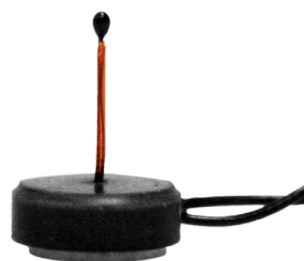
TEMPERATURE & VELOCITY SENSOR

OVERALL DIMENSIONS (D X W X H) 23.5 mm x 13.4 mm x 6.4 cm (9.3" x 5.3" x 2.5")