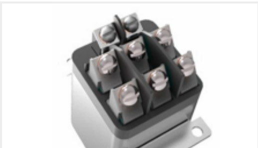
TE Part #5-1617806-5 FC-325-SY4=RELAY, 3PST