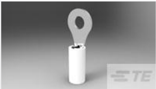
TE Part #50839-1 PIDG PTFE STRATO RING 14 6