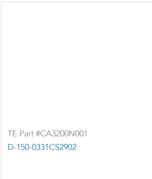
TE Part #CA3200N001 D-150-0331CS2902