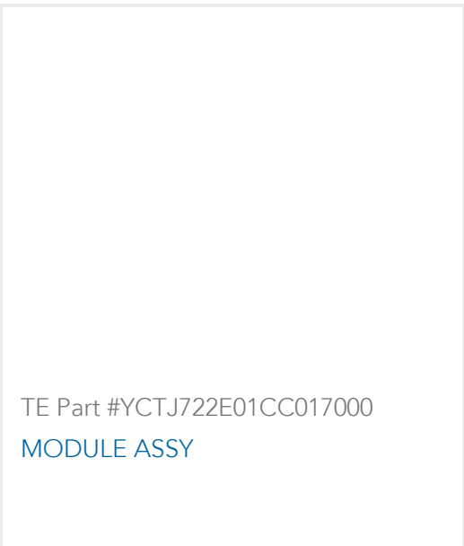
TE Part #YCTJ722E01CC017000 MODULE ASSY