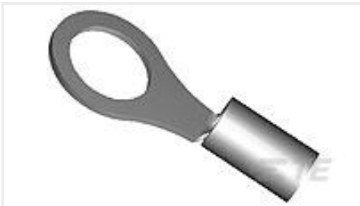
TE Part #331456 TERMINAL,T-N R 4 8