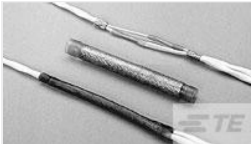
TE Part #544155-000 D-150-9133