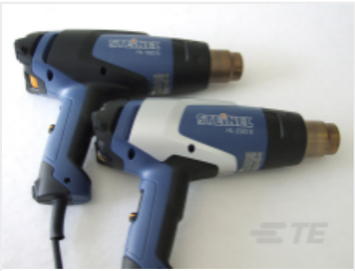
TE Part # EG8162-000 HL1920E-230V-EURO