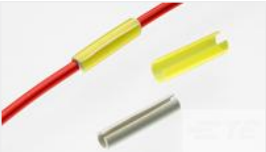
TE Part #CX2098-000 D-150-C-14