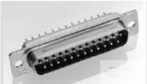
TE Part #204519-2 AMPLIMITE,ASY,PLUG,STD,90,4