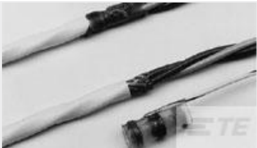
TE Part #839717-000 SO63-3-55-24-9