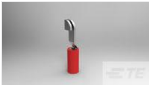
TE Part #8-32446-1 KN DISC,PIDG22-16COMM,22-18MIL