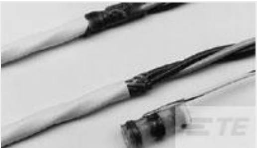
TE Part #343648-000 SO63-3-55-20-90