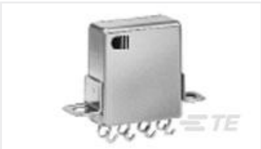
TE Part #3-1617019-7 FW1120G01 = M5757/10-039