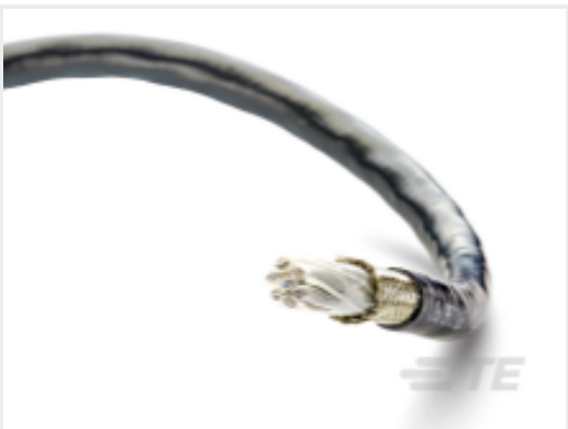
TE Part #0542253001 VG-95218-T023-F004