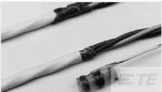
TE Part #A34354-000 SO175-2-55-22-90