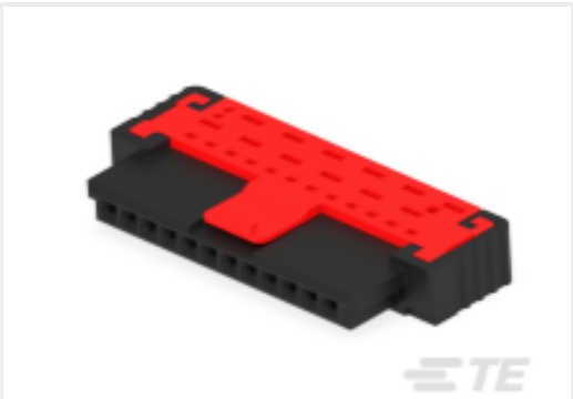
TE Part #464259-E SRCA 1,27 12 F 1 IDC22 137 E1 094 1,27 T