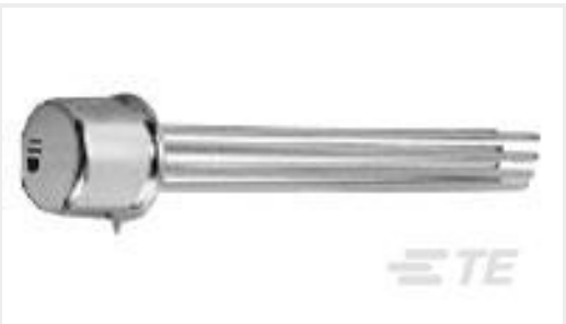
TE Part #1-1617164-9 JMAPT-26XL = M28776/1-024L