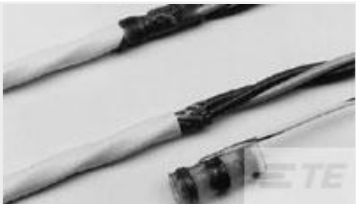
TE Part #073170-000 SO63-1-00