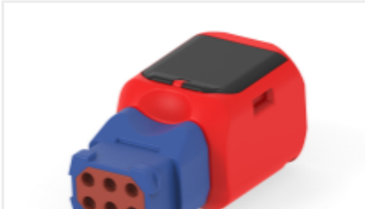
TE Part #CAT-D369-P66 Rectangular Connectors: 6-Way Plug