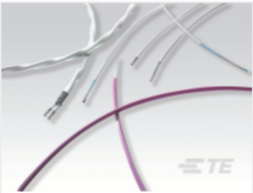
TE Part #CAT-AS22759-32 SAE AS22759: 32/33/44/45/46 - Single-Wall, Lightweight Wire