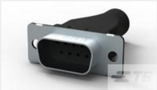
TE Part #1658645-1 KIT,HDP-20,OVRMLD,PLUG,SIZE 1,