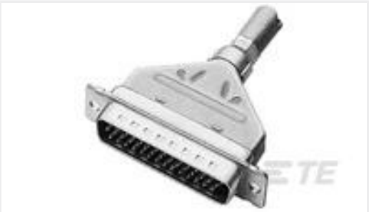
TE Part #1658676-1 HDP-22,OVRMLD,PLUG KIT,SIZE 2,