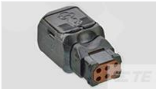
TE Part #D369-R66-BS0 369 6 WAY REC, NO CONTACTS, SKT