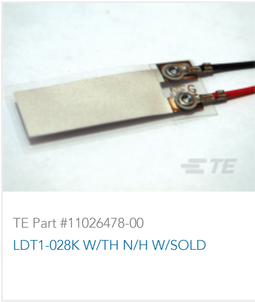
TE Part #11026478-00 LDT1-028K W/TH N/H W/SOLD