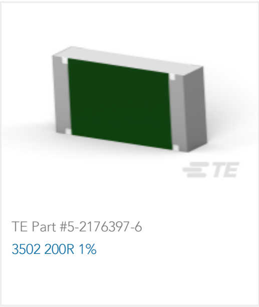
TE Part #5-2176397-6 3502 200R 1%