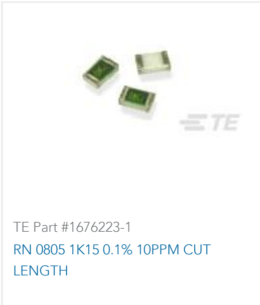
TE Part #1676223-1 RN 0805 1K15 0.1% 10PPM CUT LENGTH