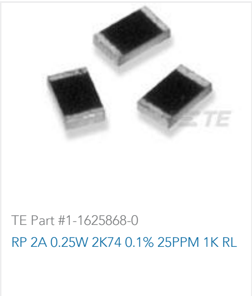
TE Part #1-1625868-0 RP 2A 0.25W 2K74 0.1% 25PPM 1K RL