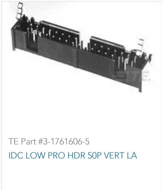
TE Part #3-1761606-5 IDC LOW PRO HDR 50P VERT LA